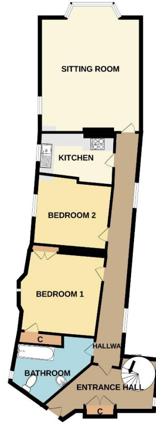
ENTRANCE FLOOR 851 sq.ft. (79.1 sq.m.) approx.