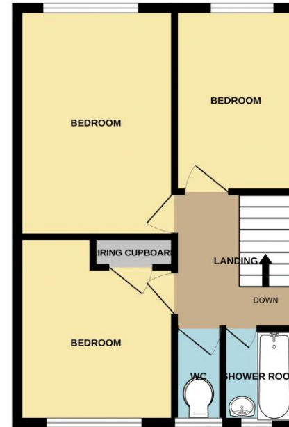
1ST FLOOR 398 sq.ft. (37.0 sq.m.) approx.