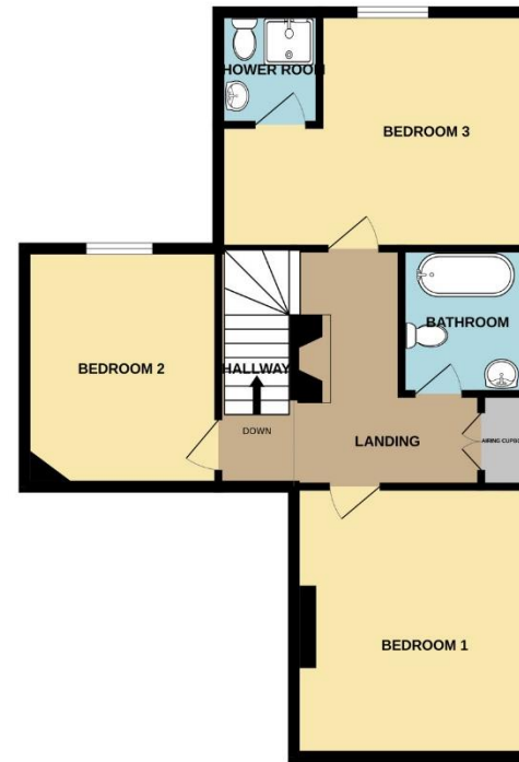
1ST FLOOR 638 sq.ft. (59.2 sq.m.) approx.