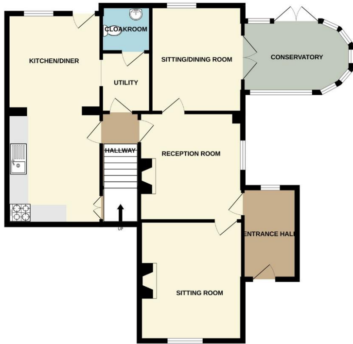
GROUND FLOOR 929 sq.ft. (86.3 sq.m.) approx.