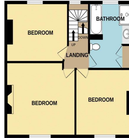
1ST FLOOR 609 sq.ft. (56.6 sq.m.) approx.