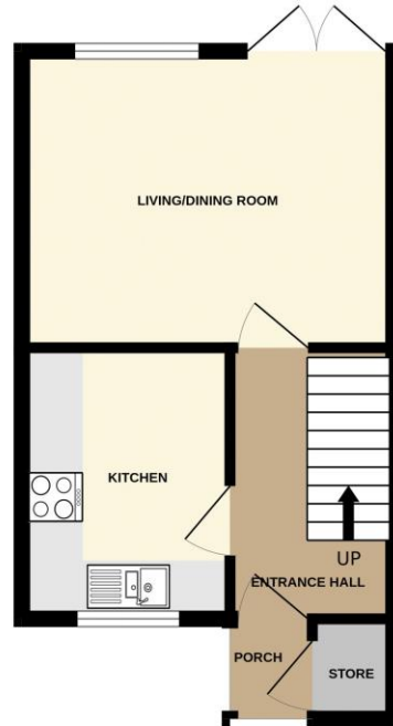
GROUND FLOOR 292 sq.ft. (27.1 sq.m.) approx.