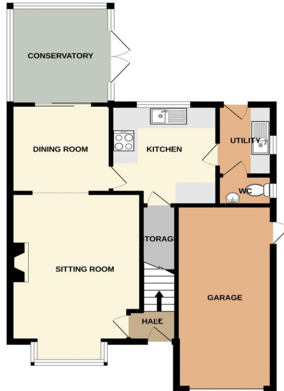
GROUND FLOOR 633 sq.ft. (58.8 sq.m.) approx.