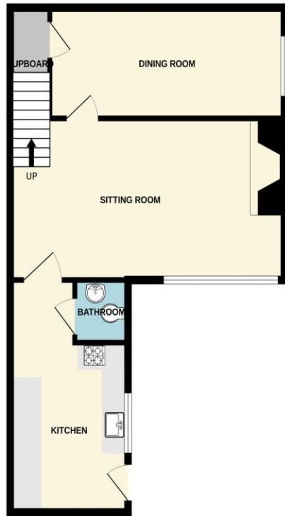
GROUND FLOOR 549 sq.ft. (51.0 sq.m.) approx.