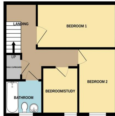
1ST FLOOR 414 sq.ft. (38.4 sq.m.) approx.