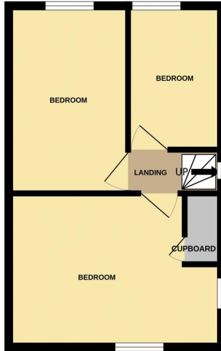
FIRST FLOOR 329 sq.ft. (30.5 sq.m.) approx.