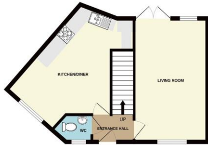
GROUND FLOOR 419 sq.ft. (38.9 sq.m.) approx.