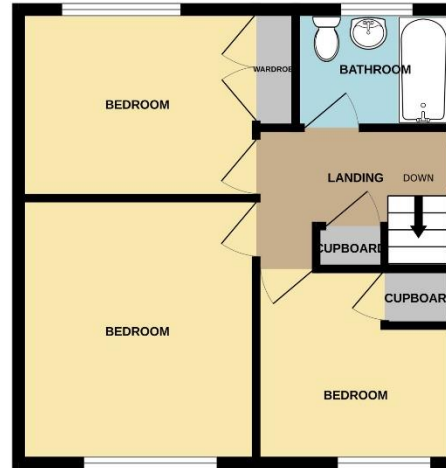
1ST FLOOR 421 sq.ft. (39.2 sq.m.) approx.