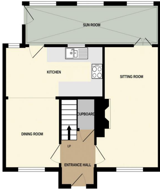
GROUND FLOOR 560 sq.ft. (52.0 sq.m.) approx.