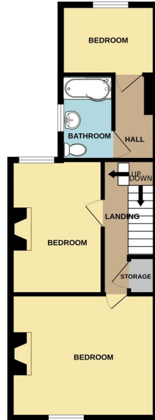
FIRST FLOOR 439 sq.ft. (40.7 sq.m.) approx.