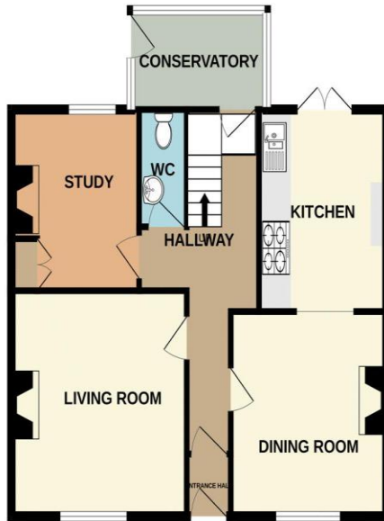
GROUND FLOOR 663 sq.ft. (61.6 sq.m.) approx.