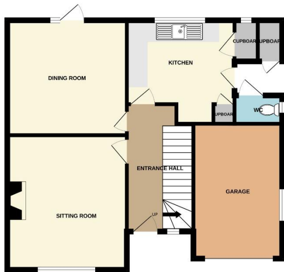
GROUND FLOOR 681 sq.ft. (63.3 sq.m.) approx.