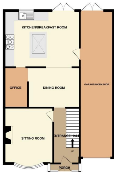
GROUND FLOOR 825 sq.ft. (76.7 sq.m.) approx.