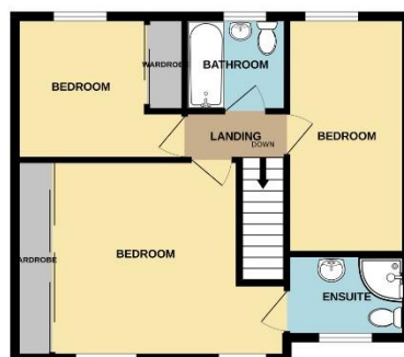
1ST FLOOR 512 sq.ft. (47.6 sq.m.) approx.