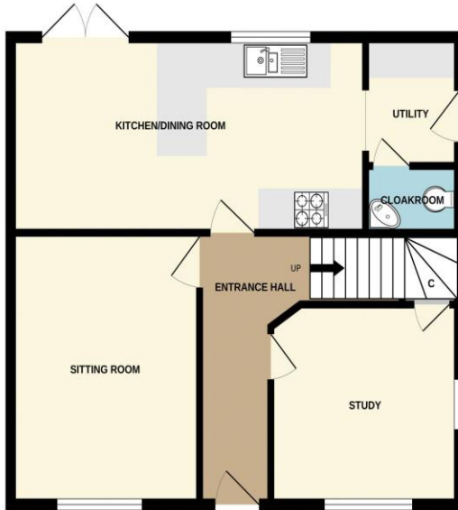
GROUND FLOOR 586 sq.ft. (54.4 sq.m.) approx.