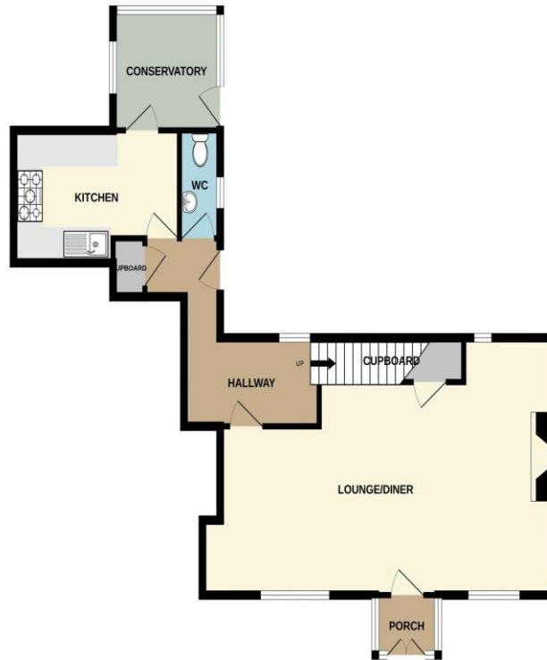
GROUND FLOOR 674 sq.ft. (62.6 sq.m.) approx.