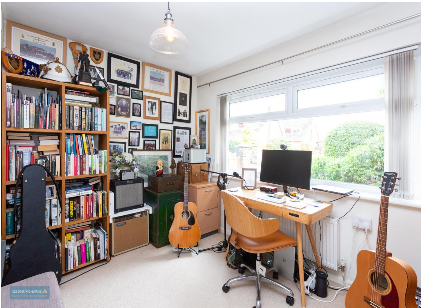
Entrance Hall Study/Office