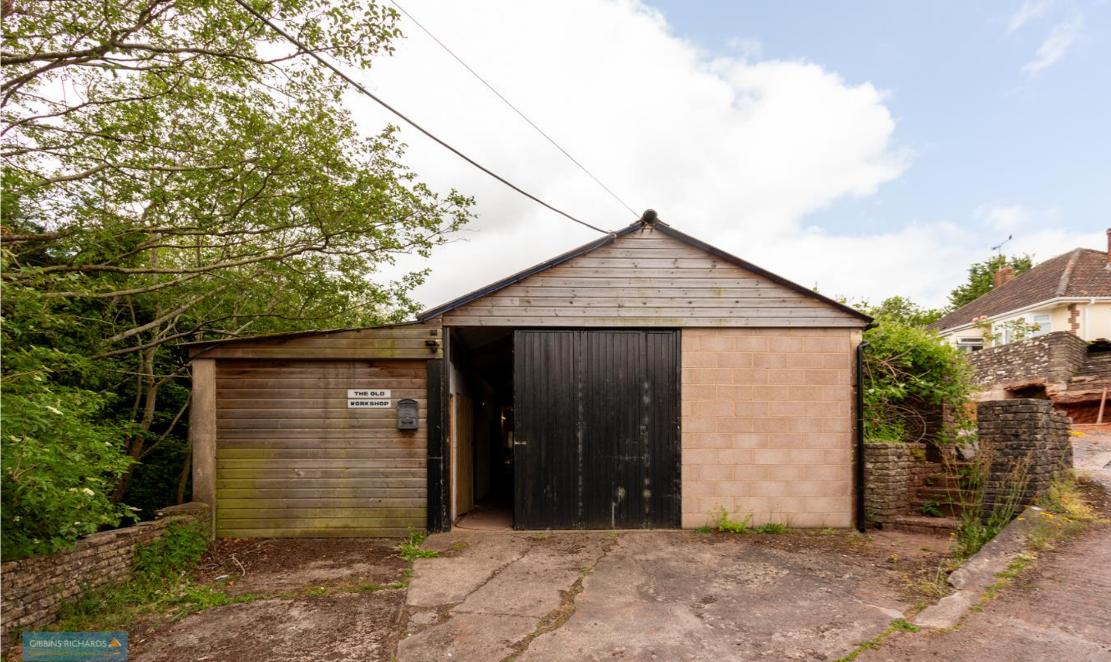
The Old Workshop , Lower Westford, Wellington TA21 0DN Guide Price, £145,000