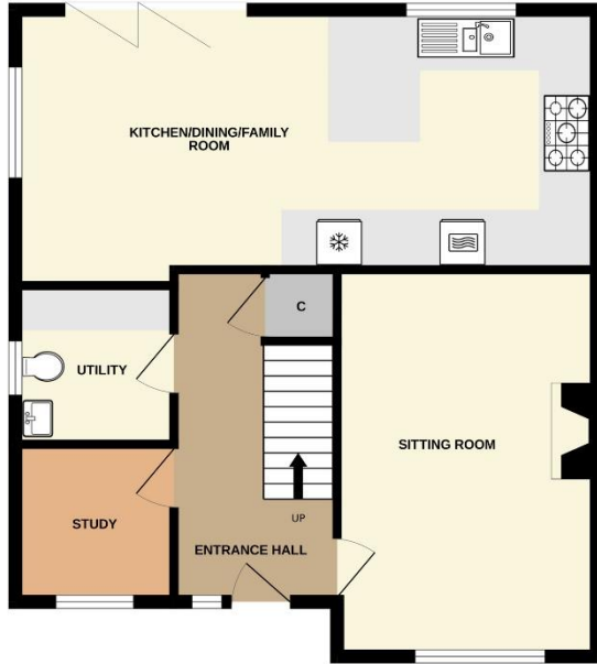
GROUND FLOOR 645 sq.ft. (59.9 sq.m.) approx.