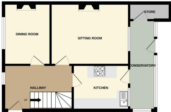
GROUND FLOOR 517 sq.ft. (48.0 sq.m.) approx.