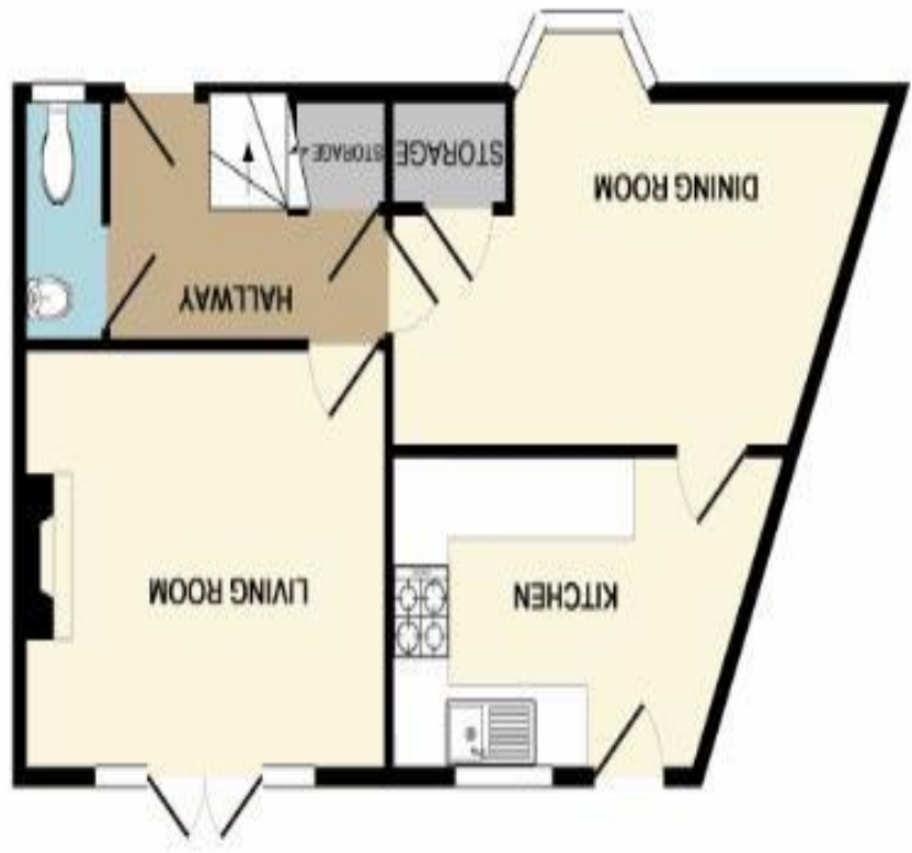
GROUND FLOOR APPROX. FLOOR AREA 465 SQ.FT. (43.2 SQ.M.)

The Agent has not tested any apparatus, equipment, fixtures and fittings or services and so cannot verify that they are in working order or fit for the purpose. A Buyer is advised to obtain verification from their Solicitor or Surveyor. References to the Tenure of a Property are based on information supplied by the Seller. The Agent has not had sight of the title documents. A Buyer is advised to obtain verification from their Solicitor. Items shown in photographs are NOT included unless specifically mentioned within the sales particulars. They may however be available by separate negotiation. Buyers must check the availability of any property and make an appointment to view before embarking on any journey to see a property.