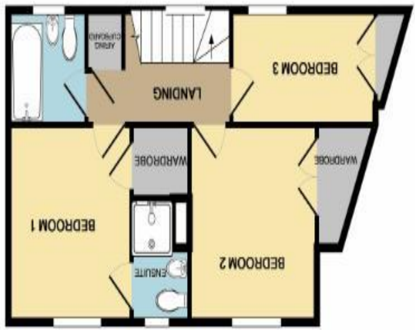
1ST FLOOR APPROX. FLOOR AREA 452 SQ.FT. (42.0 SQ.M.)

TOTAL APPROX. FLOOR AREA 917 SQ.FT. (85.2 SQ.M.) Whilst every attempt has been made to ensure the accuracy of the floor plan contained here, measurements of doors, windows, rooms and any other items are approximate and no responsibility is taken for any error, omission, or mis-statement. This plan is for illustrative purposes only and should be used as such by any prospective purchaser. The services, systems and appliances shown have not been tested and no guarantee as to their operability or efficiency can be given. Made with Metropix ©2018