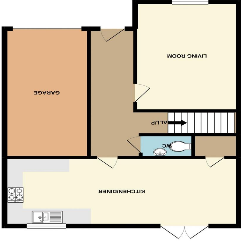
GROUND FLOOR (652 sq.ft.) approx.