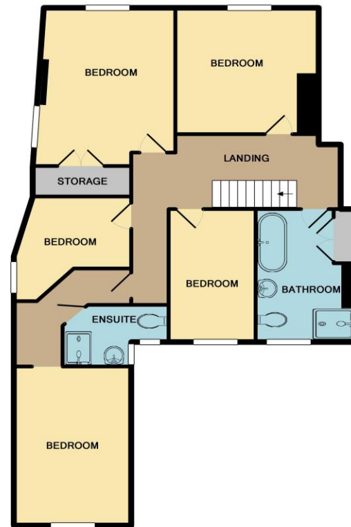
1ST FLOOR APPROX. FLOOR AREA 902 SQ.FT. (83.8 SQ.M.)